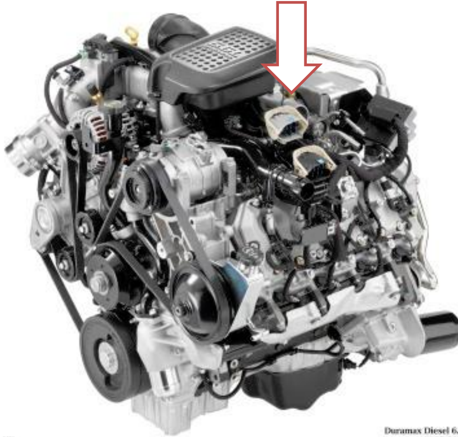
GMC Sierra HD